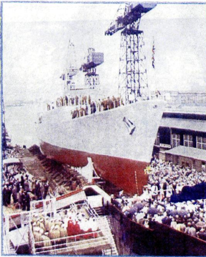
The launching of HMS Nubian from No. 5 slipway at Portsmouth Royal Dockyard, 6th. September 1960.