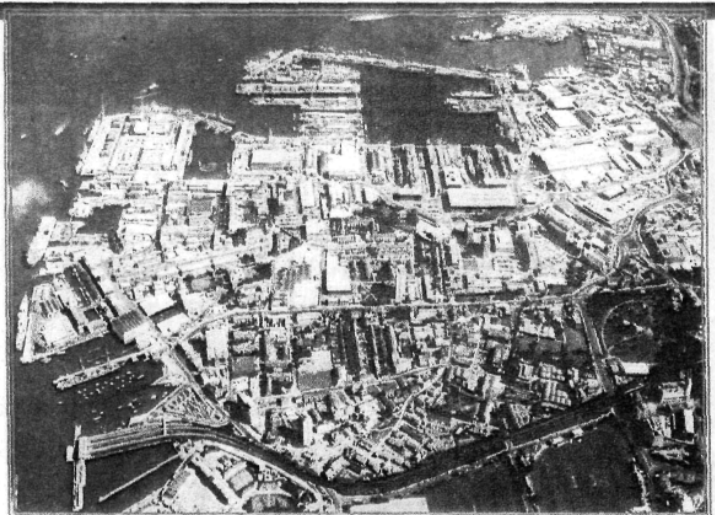
The old Royal Dockyard at Portsmouth now Portsmouth Naval Base